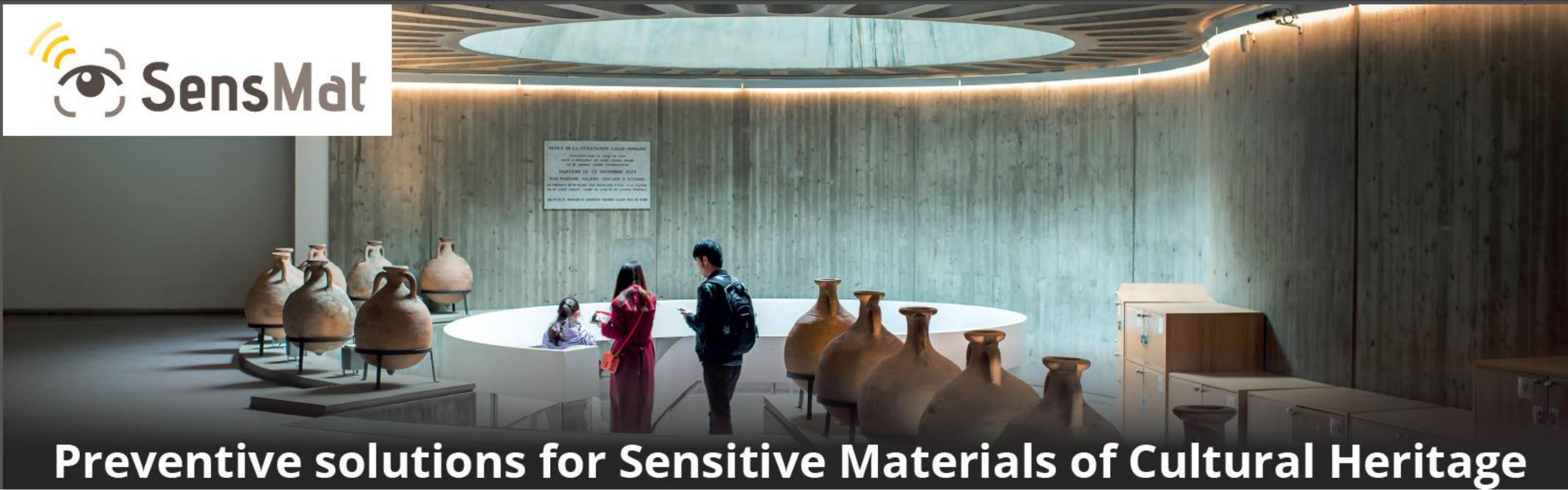
Preventive solutions for Sensitive Materials of Cultural Heritage